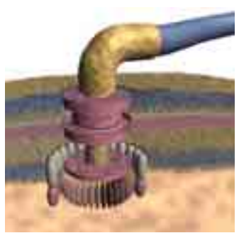
The Bacterial Flagellum

This complex structure in the bacterial flagellum alone is sufficient to demolish the