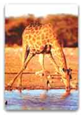
In order to survive, the giraffe's heart must pump blood up to its brain, some 2 meters above. To do this, it needs an incredibly powerful heart muscle. God has created the giraffe with all the attributes the animal needs.

in possession of certain forms of behavior and various characteristics that will protect them, right from the moment they are created. It is God Who bestows these characteristics on them.